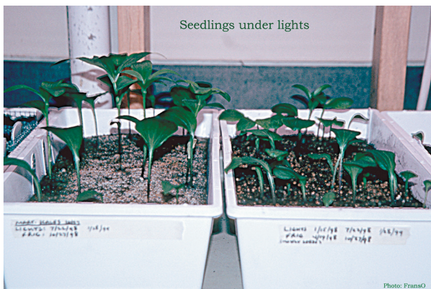
Seedlings under lights